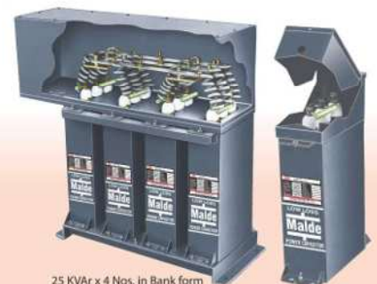
25 KVAR x 4 Nos. in Bank form

Given for information upto our best of knowledge without any guarantee as regards either for mistake or omission